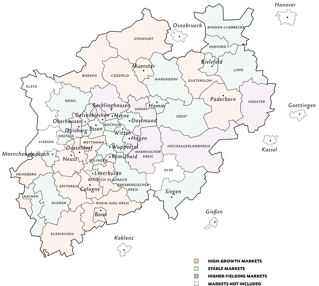
LEG in North Rhine-Westphalia by market segment

As at 30 June 2015, LEG Immobilien AG's portfolio comprised 107,347 residential units, 1,059 commercial units and 26,648 garages and parking spaces. The assets are distributed across around 170 locations in North Rhine-Westphalia. The average apartment size is 64 square metres with three rooms. The average building has seven residential units across three storeys.